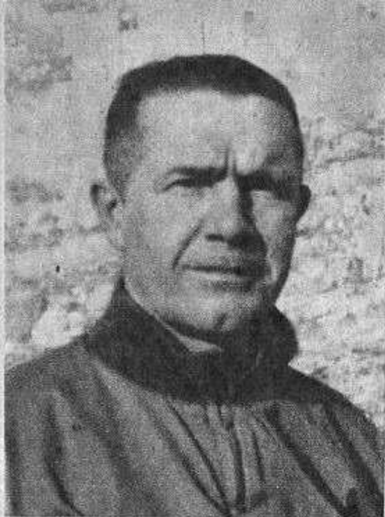
COLONEL CHARLES W. PENCE