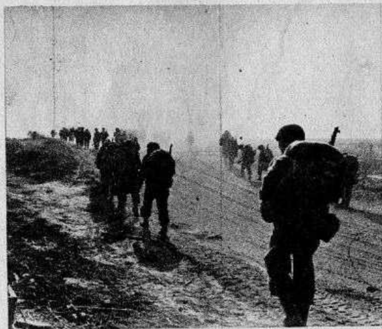
Men of the 100TH INFANTRY BATTALION moving up to the front in the Velesni area.

This was the beginning of an association that was to become famous through two armies: The 442d Infantry Regiment, the 522d Field Artillery Battalion, and the 232d Combat Engineer Company.