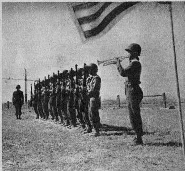
Rifle Squad of the 2ND BATTALION present arms in honor of their fallen comrades in the Cecina area.

Col du Braus, overlooking the border town of Sospel. This was reduced by early September. On 11 October, Anti-Tank Company was detached from the 517th, given a rest, and sent back to rejoin the Combat Team. The company returned to regimental control 26 October 1944, in time to assist in the battle to relieve the "lost battalion."