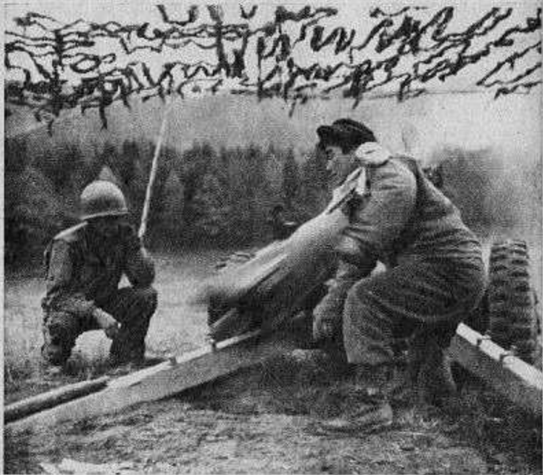
105 mm Howitzer of the REGIMENTAL CANNON COMPANY firing a mission in support of attack to relieve the "LOST BATTALION."

Progress was slow on the 27th. The terrain was next to impossible, heavily forested and carpeted with a dense growth of underbrush. Fighting went back to the days of America's Indian wars: every tree and every bush were carefully investigated before the troops passed on. Then, abruptly, the enemy drove the friendly troops off the high ground to the left flank of the 3d Battalion, opening that battalion to two major counterattacks, supported by a Mark IV tank and an armored car. Only after three hours of