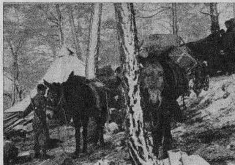
Preparing mule train for the trail to supply outpost on the Maritime Alps.