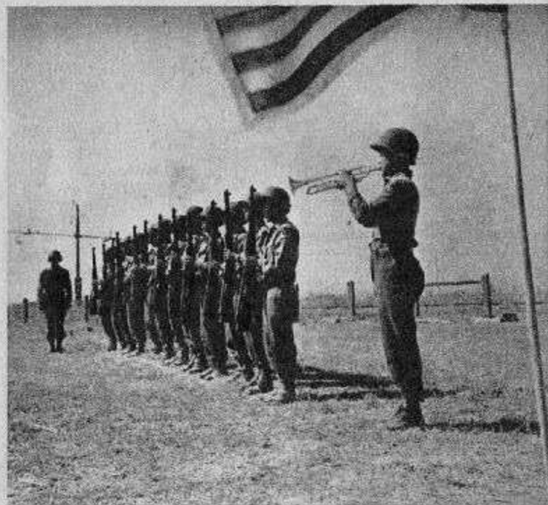
Rifle Squad of the 2ND BATTALION present arms in honor of their fallen comrades in the Cecina area.

Col du Braus, overlooking the border town of Sospel. This was reduced by early September. On 11 October, Anti-Tank Company was detached from the 517th, given a rest, and sent back to rejoin the Combat Team. The company returned to regimental control 26 October 1944, in time to assist in the battle to relieve the "lost battalion."