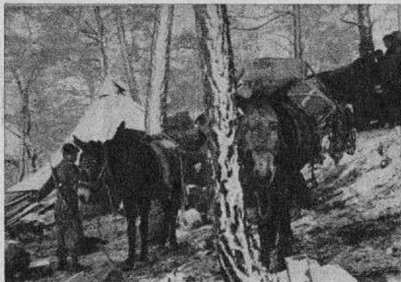
Preparing mule train for the trail to supply outpost on the Maritime Alps.