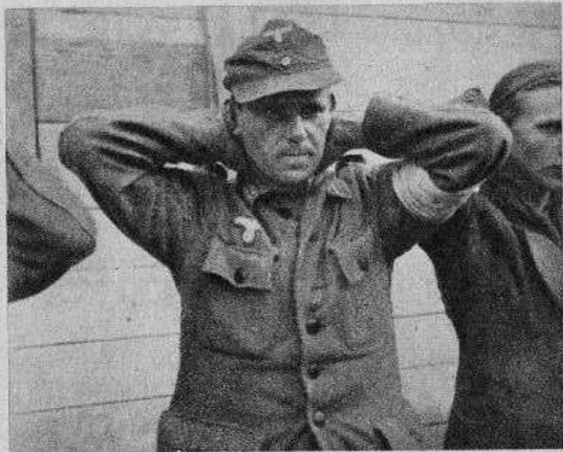
END of THE WEHRMACHT.

as the task force and 2d Battalion linked up. For the next two days as much of the regiment as trucks could be found followed the advance of the 473d, which had exploited the breakthrough and was now driving on Genoa. Finally, on the 27th, the regiment was ordered to flank Genoa from the north, seize Busalla, and block the pass at Isola del Cantone to the north, so as to cut off the enemy's escape route to Turin. The 100th immediately moved out on this mission, occupying Busalla at 1000 hours of the 28th after an all night foot march, inasmuch as it was impossible to repair bridges in time to get trucks across. Late the same afternoon, the 3d entered Genoa, riding commandeered street cars. Elements of the 3d had also accepted the surrender of a thousand enemy in the hills directly to the southeast even as Genoa was being entered. The battalion then set up defensive positions to the north and west of the city, where it remained in occupation until the cessation of hostilities.